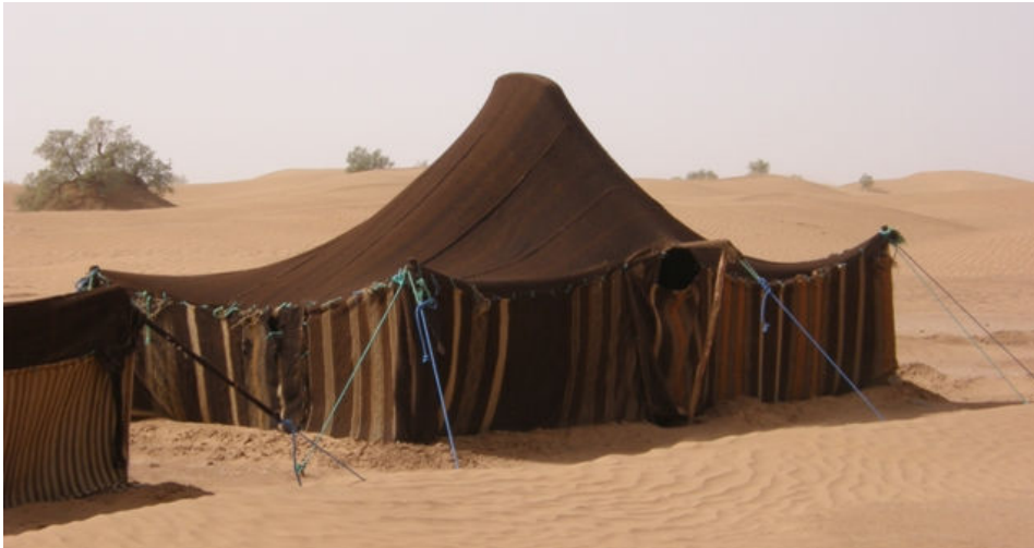
Berber tent

South of the High Atlas lies the desert mountain regions of Jbel Bani and Jbel Tadrart. In this area a 6-day camel-trek leads you through mountains, date-palm oases and sand dunes. This adventurous desert trek will take you back to ancient times of the desert caravans. You will be camping in the desert, watching the millions of stars in the sky and enjoying the silence of the desert night. The journey will begin near the town of Zagora and end at M'hamid, a large oasis. Camels will carry your luggage and you will be accompanied by an expert guide. The average distance covered per day is approximately 25 kilometres / 15 miles between 5-6 hours of walking.