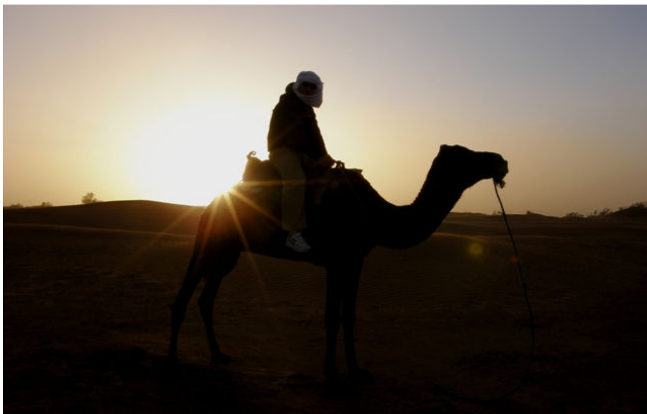
Camel trek in the Sahara